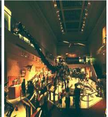
Above: Dinosaur Exhibition Hall